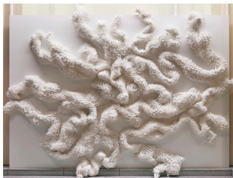
MATSUMOTO Chisato 『Imagine the crowd』