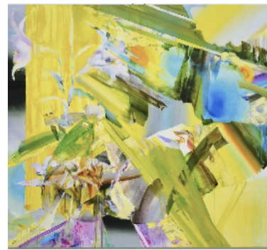
JO Aine 『Evening bell』