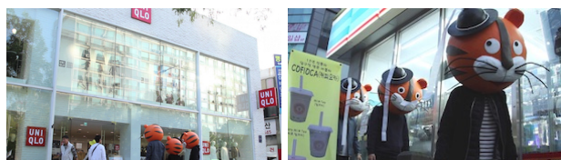
The Moon over the Mountain (2017) HD video installation

Based on his experience as an elementary school teacher, Takayuki Yamamoto creates encounters with the unknown through workshops with children, critiquing the education system while searching for alternatives through art. In recent years he has conducted research in different areas with a focus on folklore, making work themed around the relationship between modern social systems and the individual. His exhibitions include the Kochi-Muziris Biennale (India, 2016–17) and “Constellations: Practices for Unseen Connections/Discoveries” (Museum of Contemporary Art Tokyo, 2015).