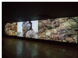
Mud Man (2016) 3-channel high-definition video installation 23'00" Thanks to Aichi Triennale 2016 ©Chikako Yamashiro Courtesy of Yumiko Chiba Associates