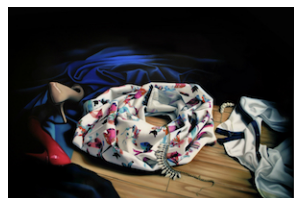
But then, finally I could be myself (2016) Oil on panel 130.3 x 194 cm