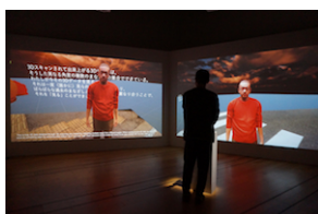
Something Similar to Me / About Seeing Things (2016) Computer, projector, game controller