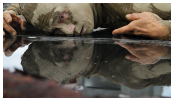
The Beginning of Creation: Abduction / A Child (2015) HD video 18'00" ©Chikako Yamashiro Courtesy of Yumiko Chiba Associates (AAC, APMoA Film No.24, 2015)

Chikako Yamashiro uses both video and photography to create video work that explores the geopolitics of her native Okinawa. In recent years she has drawn on overseas narratives and history in order to develop her interpretation of the problems in Okinawa as not just a local issue, but a story of the weak being oppressed by the strong in the same way as can be seen all over the world. Recent exhibitions include "From Generation to Generation: Inherited Memory and Contemporary Art" (Contemporary Jewish Museum, USA, 2016–17) and the Aichi Triennale 2016 (former Meidi-ya Sakae Building).