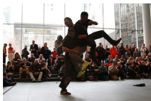
Performance at Museum of Modern Art / NY (2014)