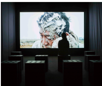
Mud man (2017-Film ver.) by Chikako Yamashiro

Born in Okinawa in 1976 / Resides in Okinawa Chikako Yamashiro uses both video and photography to create video work that explores the geopolitics of her native Okinawa. In recent years she has drawn on overseas narratives and history in order to develop her interpretation of the problems in Okinawa as not just a local issue, but a story of the weak being oppressed by the strong in the same way as can be seen all over the world. Recent exhibitions include “From Generation to Generation: Inherited Memory and Contemporary Art” (Contemporary Jewish Museum, USA, 2016–17) and the Aichi Triennale 2016 (former Meidi-ya Sakae Building).