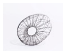
Tanabe Chikuunsai IV × Kaijima Sawako Disappear I