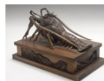
Okunishi Kishou Ise (Ise-ebi), Japanese spiny lobster, Kamakura-bori lacquerware