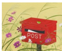
Isobe Kotaro Biotop, waiting for a letter