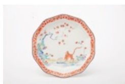
Decagonal dish, with plum, bamboo & tiger design, in overglaze enamels, Imari Ware

Tokyo Art Club, a bastion of fine art, once showed works by John Lennon and Yoko Ono, writer Kuniko Mukoda, and in more recent times, Takashi Murakami and many other cultural icons. As the location of 2017 Tobi Art Fair, attendees will be able to see works up-close, touch them, and purchase art that is not normally available. Above all it is an art fair where reliable art dealers can be found.