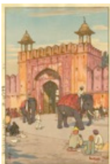
Yoshida Hiroshi Ajmer Gate, Jaipur