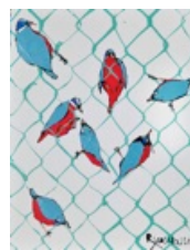
Imai Ryuma 7 Small birds perched on green net fence 2017