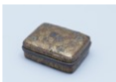
Incense case with plum arabesque in gold lacquer with tin edges