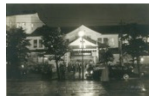
exterior view of Tokyo Art Club in 1970

Tokyo Art Dealers' Association comprises approximately 500 dealers selected according to strict criteria. In addition to Tobi Art Fair, it organizes the Special Triennial Tobi Art Fair, which was originally held alongside the 1964 Tokyo Olympics as the first art fair in Japan, as well as the Tobi Shofudakai, an antiques bazaar that has been held since 1952.