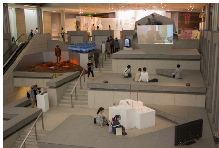
A long time ago in a galaxy far, far away...