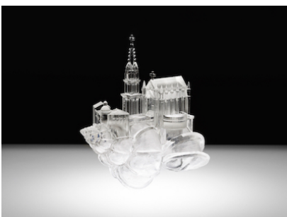
Why Not Hand Over a "Shelter" to Hermit Crabs? -White Chapel- 2014 Resin 6 6 x 6cm