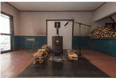
A Song For My Son-Kambara

Yokohama Triennale 2014 (Yokohama Museum of Art).