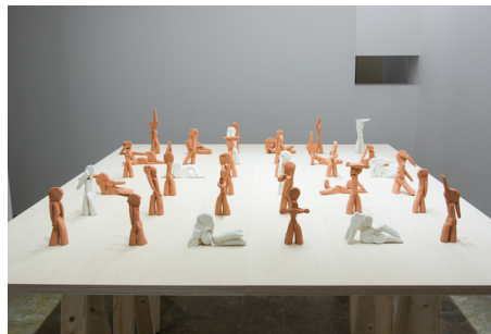
Composition for Clay