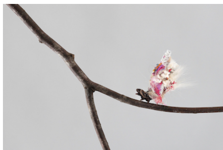
girl, girl, girl . . . 2012 Bagworms, fabric, HD video, photograph Dimension variable ©AKI INOMATA. Courtesy of MAHO KUBOTA GALLERY