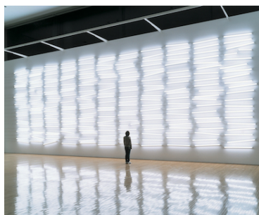
Propagation of Electric Current 2009 223 fluorescent lamps, timer Dimension variable