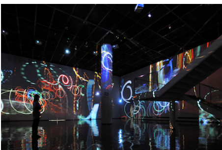
Graffiti of Velocity 2008 Multichannel video installation Dimension variable